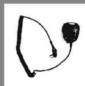
Remote Speaker Microphone SM08M3