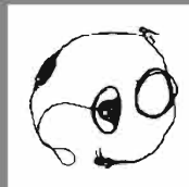
D-earset with In-Line MIC & VOX EHM15