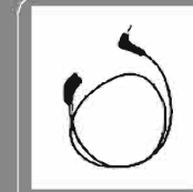
Receive-Only Earpiece (for use with remote speaker microphone) ESS07

Note: Pictures above are for reference only and may vary from actual product.