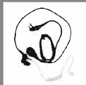
Earpiece with on-MIC PTT & Transparent Acoustic Tube EAN12