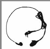
Earbud with on-MIC PTT & VOX ESM12