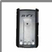
Li-Ion Battery (1300mAh) BL1301