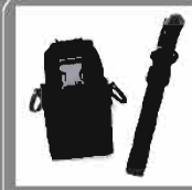
Nylon Carrying Case (not swivel)(black) NCN001