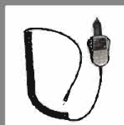
Vehicle Power Adapter CHV08