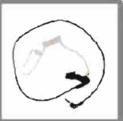
Receive-Only Earpiece with Transparent Acoustic Tube (for use with remote speaker microphone) ESS08